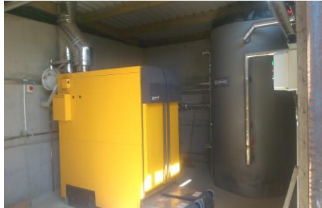
The new biomass plant room at Bettws Hall

This is being supplied by Edge Renewables from its biomass fuel production facility which processes timber sourced from sustainably-managed forests within the local area to help minimise transportation.