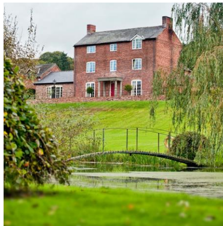
Bettws Farm House – One of the properties available to the shooting parties

with fuel-handling and control systems, the installation was completed and commissioned in March 2015.